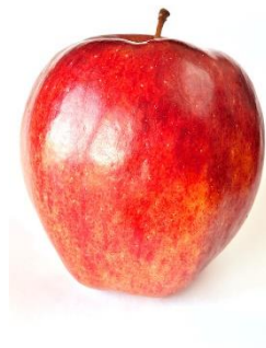
Photo credits: Photos are Creative Commons licensed, Cynthia Argentine's, or free public domain.

"Flour d'orange" by TOIRA is licensed under CC BY-NC 2.0 "watermelon" by ginige is licensed under CC BY-NC-SA 2.0 "Die reifen Orangen vor weißem Hintergrund" by marcovanni is licensed under CC BY 2.0 "20090726095302 Watermelon Flowers - Dressler Lane" by pverdant is licensed under CC BY-NC 2.0 "Perfect strawberry" by jh688 is licensed under CC BY 2.0 "Strawberry plant at Joy Creek Nursery" by Gardening Solutions is licensed under CC BY-NC 2.0 "Apple" by Open Grid Scheduler / Grid Engine is licensed under CC0 1.0 "Strawberry seeds" by NSW DPI Schools program is licensed under CC BY-NC-SA 2.0