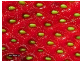
Photo credits: Photos are Creative Commons licensed, Cynthia Argentine's, or free public domain.

"Fleur d'orange" by iOurs is licensed under CC BY-NC 2.0 "watermelon" by ginigei is licensed under CC BY-NC-SA 2.0 "Drei reife Orangen vor weißem Hintergrund" by marcovech is licensed under CC BY 2.0 "20090726095302 Watermelon Flowers - Dressler Lane" by pverdonk is licensed under CC BY-NC 2.0 "Perfect strawberry" by jfh686 is licensed under CC BY 2.0 "Strawberry plant at Joy Creek Nursery" by Gardening Solutions is licensed under CC BY-NC 2.0 "Apple" by Open Grid Scheduler / Grid Engine is licensed under CC0 1.0 "Strawberry seeds" by NSW DPI Schools program is licensed under CC BY-NC-SA 2.0